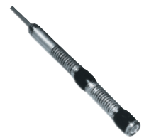
TRACKER™ IN-LINE TRANSMITTER