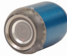
PRO EYE SELF-LEVELING COLOR CAMERA HEAD