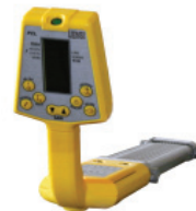
TRACKER™ II LOCATING RECEIVER