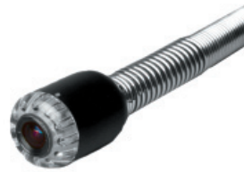
CH-3 COLOR CAMERA HEAD