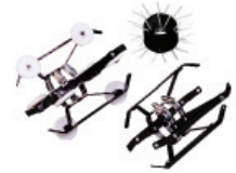
6"-15" CENTERING SKIDS ROLLER SKID [LEFT], BRUSH SKID [MIDDLE], ALUMINUM SKID [RIGHT]