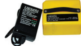
AC BATTERY PACK KIT