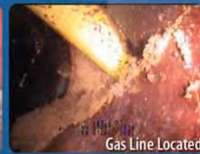
Gas Line Located

800.327.7791 www.cuesinc.com salesinfo@cuesinc.com