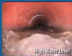
High Water Level